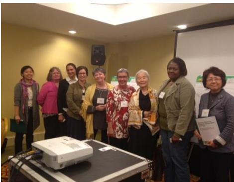
Be Just Be Green Jurisdiction Guides NCJ Guides: 1 st from left & 4 th from left