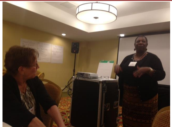
Jurisdiction Training Event