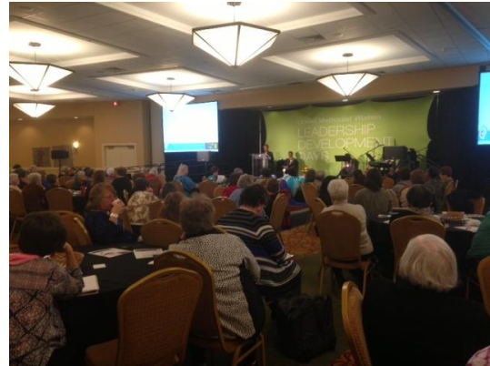
Leadership Development Days