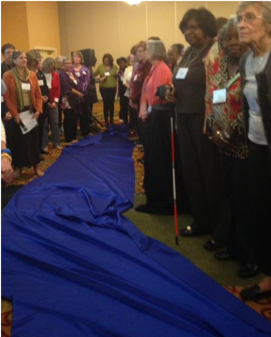
God is in the Graffiti