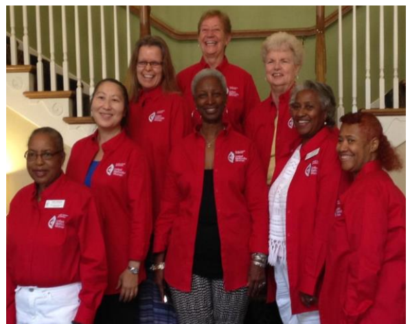
North Central Jurisdiction Leadership Team (Left to right)