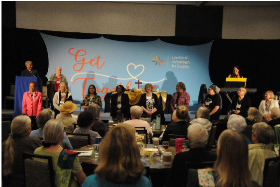
new NCJ team (2024-2028)