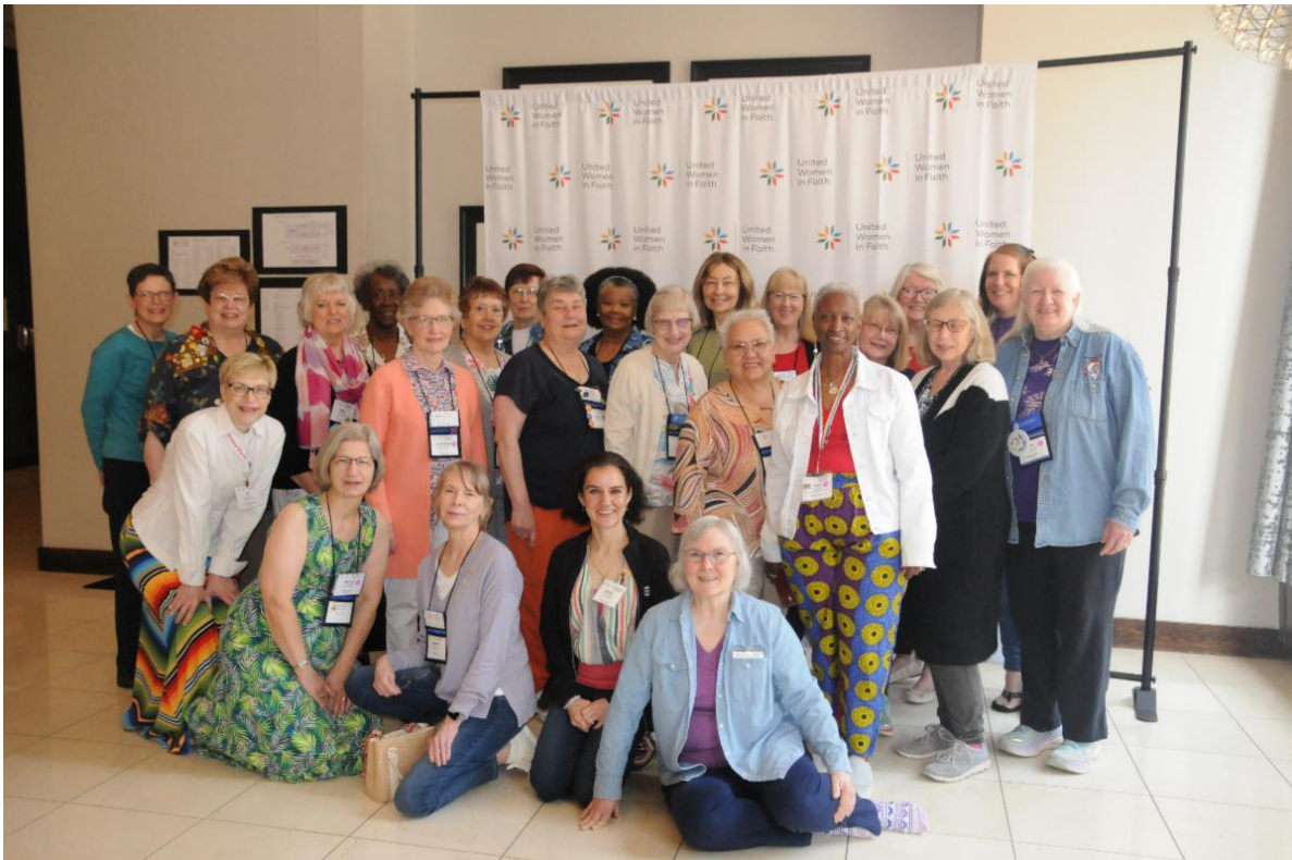
Northern Illinois Conference attendees