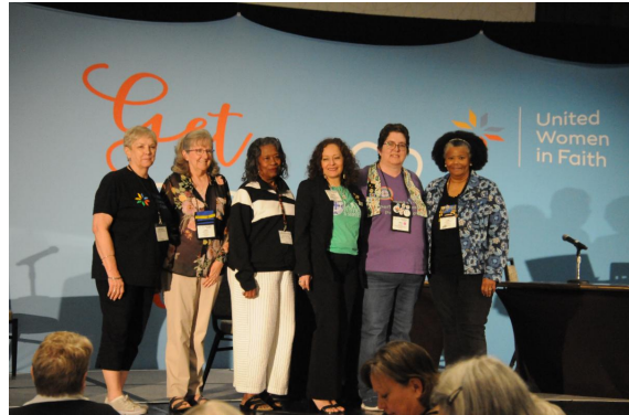
2024-2028 Directors and Alternates (alternates on the ends)