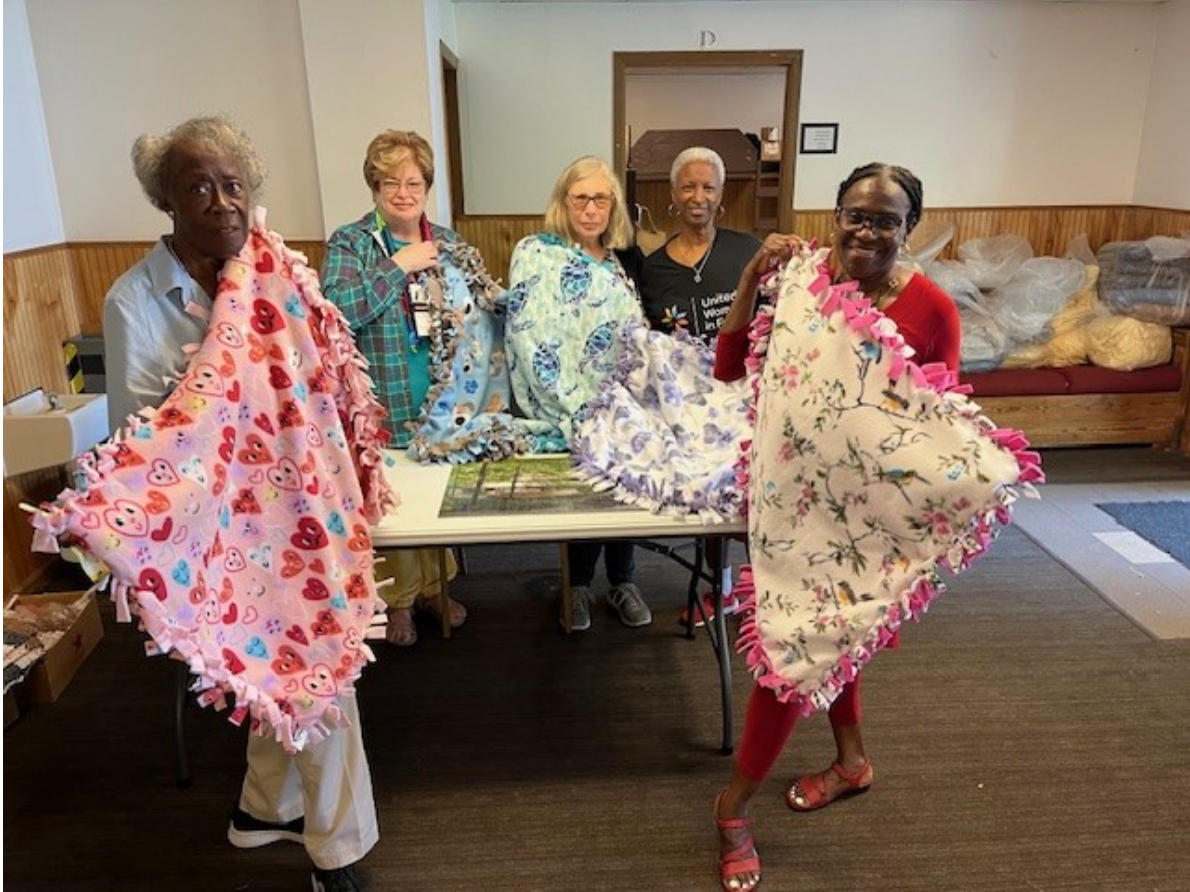
Several members made no sew fleece blankets for Kids Above All