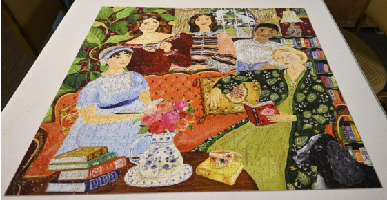
Many puzzles put together