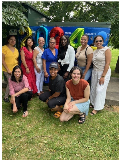
West Side Early Childhood Staff are grateful for FUMCAH support