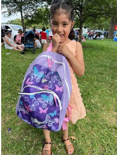
West Side HIPPY received special Graduation Back Packs paid and assembled by UWFaith FUMCAH