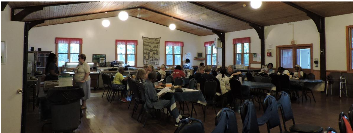
Sharing many meals together