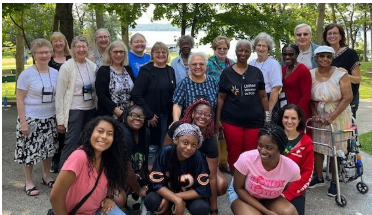
Cheerful Mission u attendees at Wesley Woods!