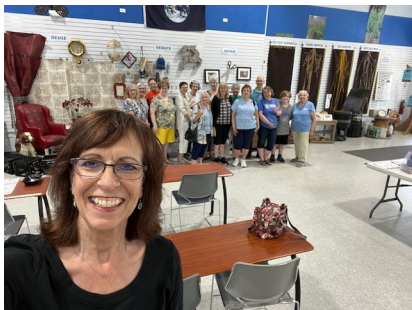
I joined UWFaith Prairie Central at SCARCE